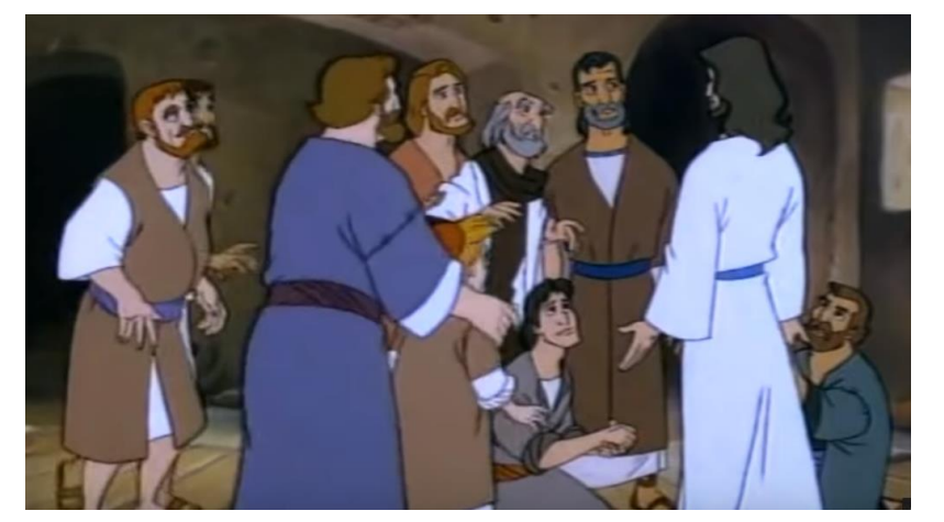
Peter: I ran to see the empty tomb. Jesus's body was gone. Later that evening, the disciples had a secret meeting. Jesus appeared to us! He asked us to touch Him. He ate food. He has a body. Luke 24: 36-43