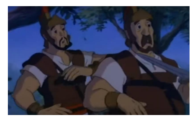
Soldier: I was guarding the tomb. An angel came and rolled the stone off of the tomb door. I was very scared. Matthew 28:2-4